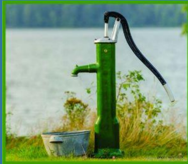
NSWA Groundwater Forum - February 27th 2019

Join us to learn about groundwater basics, industry perspectives, local groundwater initiatives and more. Free registration but space is limited! For a draft agenda and more information please check the Eventbrite link.