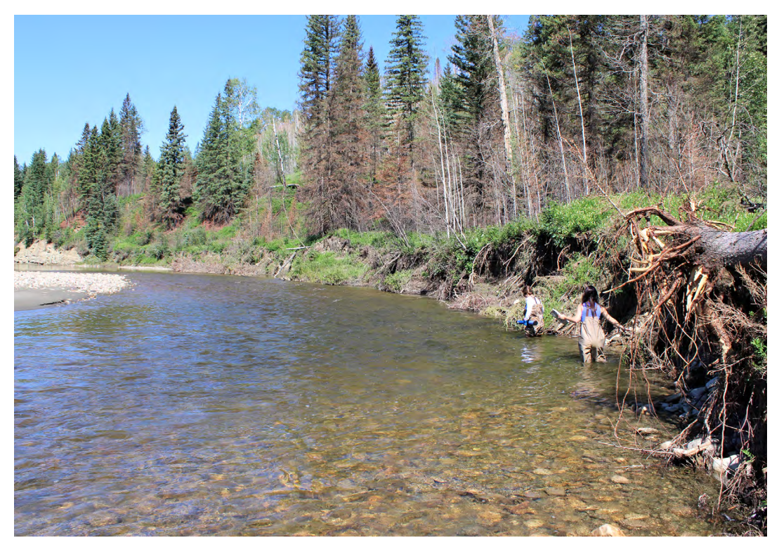
As water technologists work along the Nordegg River, impacts of recent wildfires can be seen in the upland forest area.

The parameters monitored at these stations are typical for other projects across Alberta. These include general chemistry, pH, trace metals, and nutrients, including nitrogen,