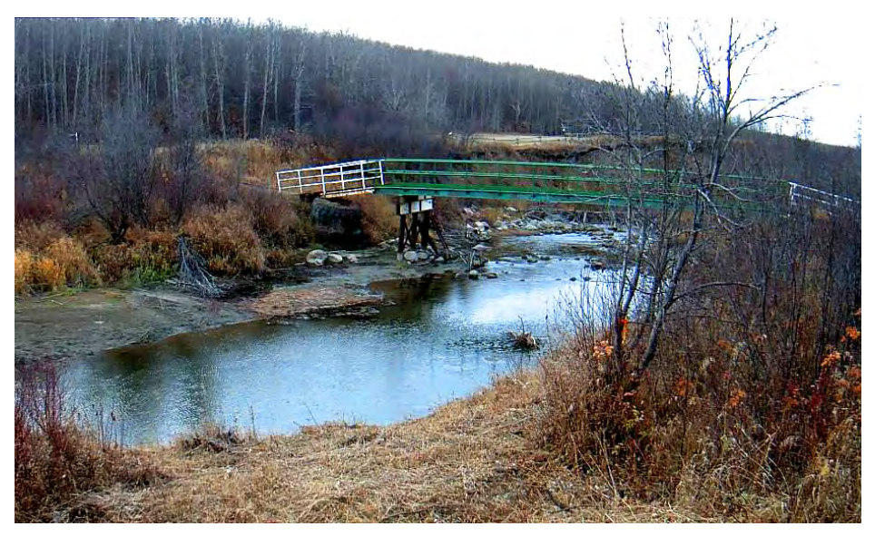
An automated image from the Vermilion River station at Lea Park in late fall, 2022.