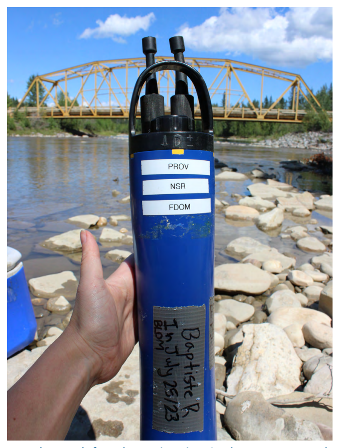
A data sonde from the Baptiste River. Sondes measure general water quality parameters, including water temperature, specific conductivity, pH, turbidity, and dissolved oxygen.