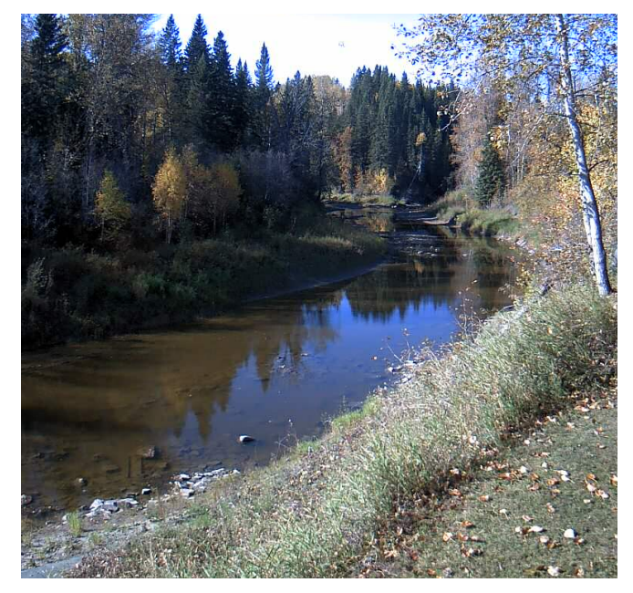
Station snapshot at Modeste Creek near Lindale looking upstream to confluence with Bucklake Creek on September 25, 2023.

Looking ahead, WaterSHED will not only collect data on a host of chemical parameters, but aim to "expand biological monitoring." Our expert explains the importance of monitoring biological health, noting that "the communities that live there may be better indicators of the health of the river because they live in one place and experience all the changes in water quality." The Watershed Integrity Project, a joint venture between the University of Alberta, the Government of Alberta, and funded by Alberta Innovates, completed 'whole ecosystem monitoring of tributaries across the North Saskatchewan watershed' and analyzed benthic species and microbial communities to better understand the impacts of land-use changes on ecological health. However, the scientist notes that collecting biological data is time-consuming and labour-intensive, providing a major barrier for many monitoring programs. Environmental DNA (eDNA) monitoring provides an exciting potential solution, allowing scientists to interpret the types of species present in each water sample through efficient DNA analysis. It is only a matter of time before eDNA data becomes more readily available in our watershed, allowing WaterSHED to bolster its chemical data, and provide us with a clearer understanding of the general health of the entire network.