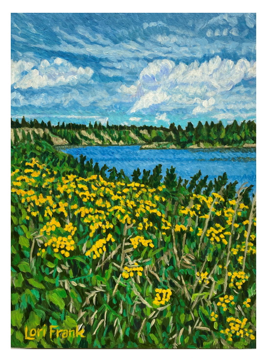
Among the East Trails