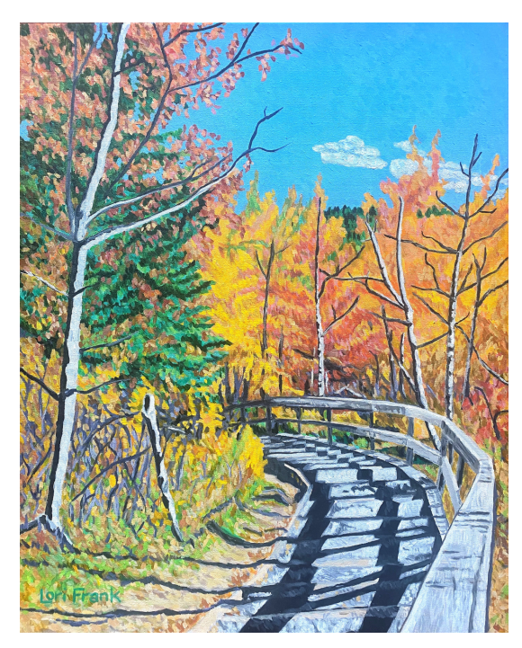
An Autumn's Ascent - Laurier Park