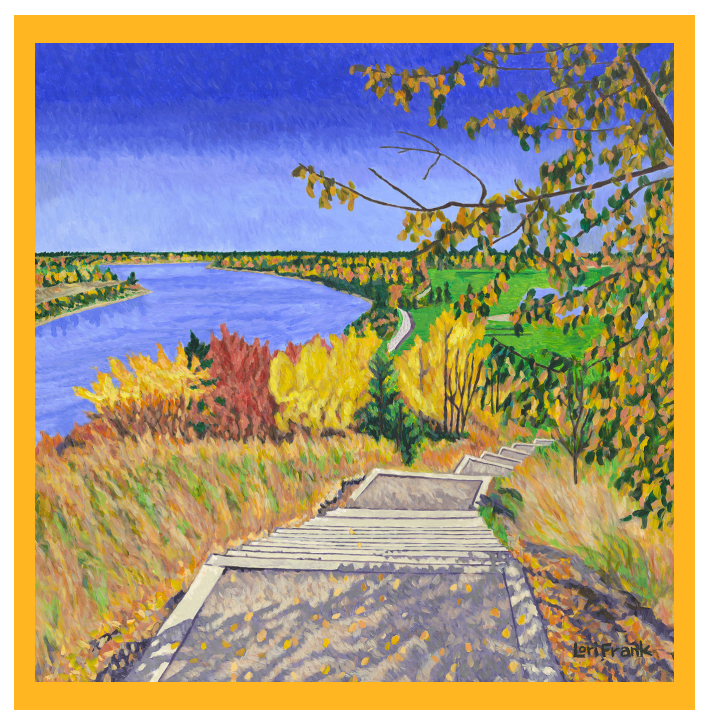
The Viewpoint - East End Trails

Lori's art has come full circle - one of her first paintings was of a stairway downtown at 114 Street and 99 Ave. The original of her latest painting, 'The Viewpoint', was a commission for the person that oversaw the design of the staircase on the East End Trails and is one painting in the 'Stairway to Heaven' series.