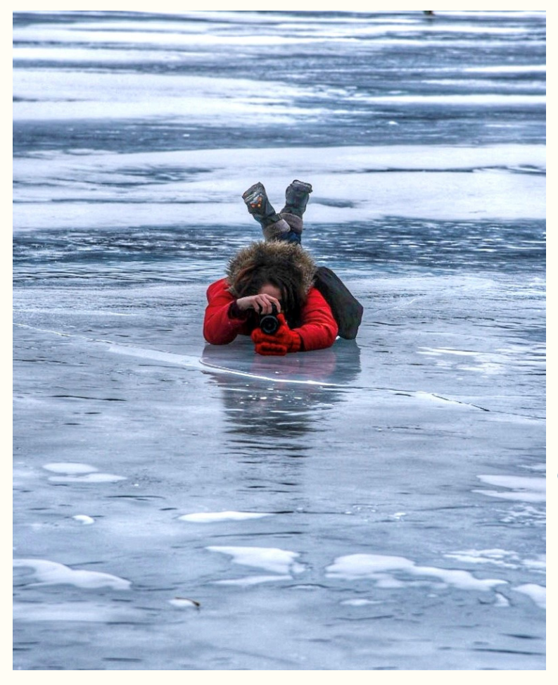
Harmony at Abraham Lake

"I am originally from St. Albert, and now live with my husband in North Edmonton. I have been teaching esthetics and clinical esthetics for about 35 yrs, and I am the Director of Education at the European Institute of Esthetics - Esthetic & Laser Training. I work 3 or 4 days a week and on my days off I love to get out and explore with my dog, choosing different locations all the time. With all the time spent in the river valley and areas within the water sheds, photography seemed like a natural evolution. I knew nothing about photography when I first started. I began with my cell phone and saw the landscape in a whole new way. I caught the photography bug and have never looked back. I bought my first DSLR camera and just continued hiking and learning, in all seasons!"