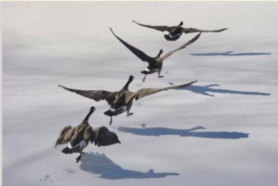
Canada Geese take Flight

The Sturgeon River Watershed Alliance (SRWA) was established in 2014 and includes stakeholders from 12 municipalities as well as Alberta Environment and Parks and non-government organizations. In the last four years the SRWA has received grant funding of over $500,000 to conduct watershed studies that helped fill the data gaps identified in the State of the Sturgeon River Watershed (2012). Watershed studies completed include: