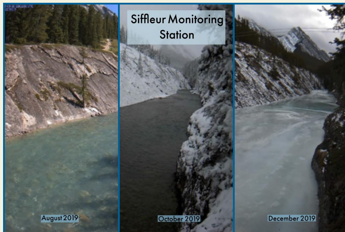
Camera Images from the Siffleur River Monitoring Station

The WaterSHED Monitoring Program is a unique partnership between Alberta Environment and Parks, EPCOR, North Saskatchewan Watershed Alliance and the City of Edmonton.